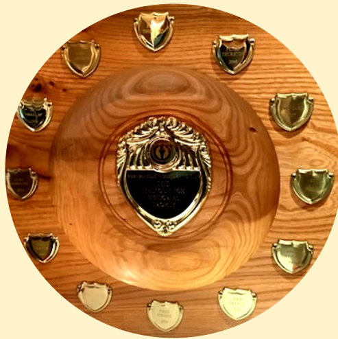
Malcolm Fox Memorial Competition 2019