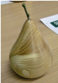
Pear in Yew Ian Cotgrove