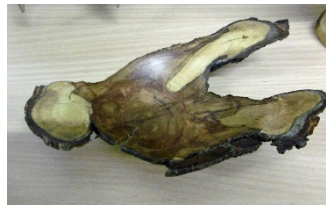
Natural Edge Dish Eric Harvey